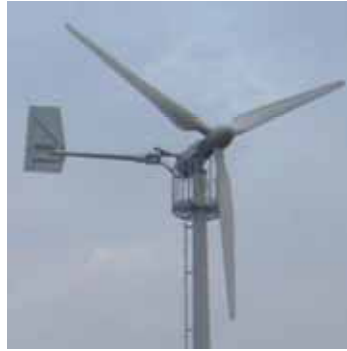
PowerMax+ 20kW with the tail furling to position the blades out of a direct wind.